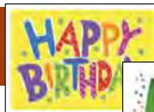
Item No. C101