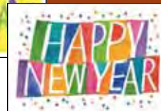
Item No. C102