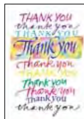
Item No. C105