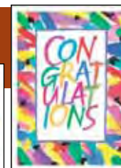
Item No. C103