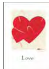
Item No. C106