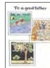
Item No. C107