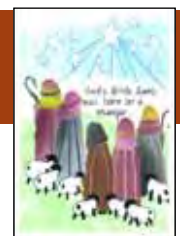
Item No. C104