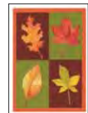
Item No. C108